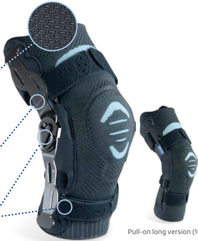
Pull-on short version (12")