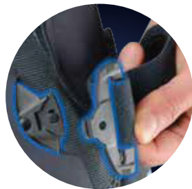
Low profile tension buckles