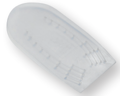
Height 1/5 inch